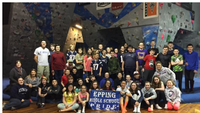
Epping Middle School Students visit Vertical Dreams in Manchester for a night of indoor rock climbing.