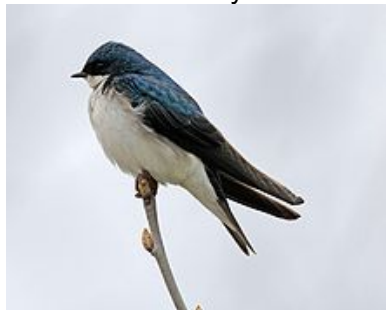
Tree Swallow

people might not know is that almost all songbird chicks, regardless of what the parents eat, need to consume insects to provide necessary proteins and fats. In fact, 96% of all songbird chicks require insects. A recent study by Cornell College of Agriculture and Life Sciences has also shown that fats from aquatic insects promote more rigorous growth and better immune responses in tree swallow chicks than the same quantity of terrestrial insects. (Cornelia W. Twining, Proceedings of the National Academy of Science, Sept. 27, 2016)