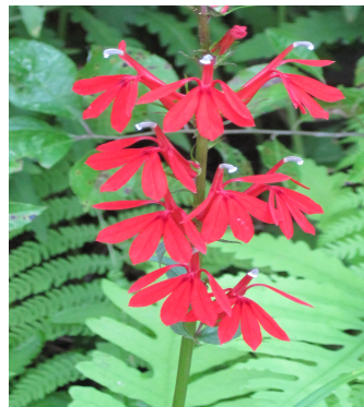
Cardinal flower at Mary Blair Park in Epping

The trees that thrive on floodplains have adapted to occasional excess water: red maples, silver maples, black ash, black cherry, swamp white oak, sycamore, river birch, muscle wood, and American elm. Some of the more noticeable understory plants are vibrant red cardinal flowers and various ferns. Because the flood plains are wet and tend to be thickly vegetated, hiking can be difficult.