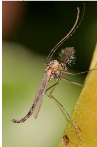
Adult male Chironomus plumosus wikipedia.org

As any fishing enthusiast knows, many aquatic insects hatch in spring and the fish are quick to respond to the bounty of food. Most birdwatchers might also be aware that these same aquatic insects are critically important to migratory birds which need to refuel during or after their long flight and to prepare for the rigors of a new nesting season. Aquatic insects such as midges are abundant earlier than most terrestrial insects. This early banquet along rivers and wetlands meets a need that cannot be met elsewhere in the habitat during this time.