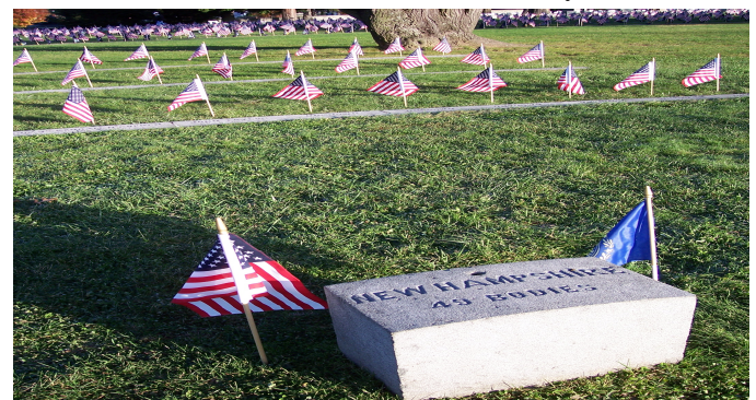
NH graves at Soldiers' Cemetery in Gettysburg